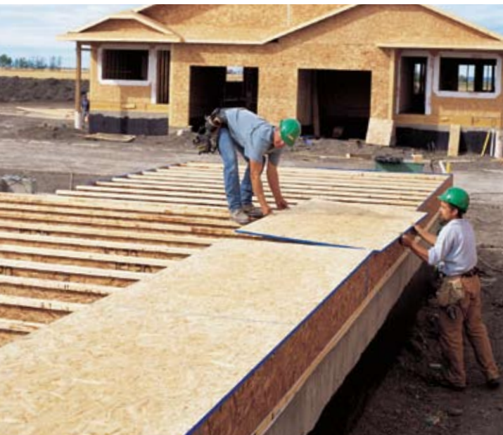
The Durastrand Formula for Performance

Designed with AinsworthEngineered ® technology, Durastrand is the mark of quality and reliability. Each product in the Durastrand family has its own unique formula. Each is engineered and produced under strict controls to meet high performance criteria for specific applications in construction and manufacturing.